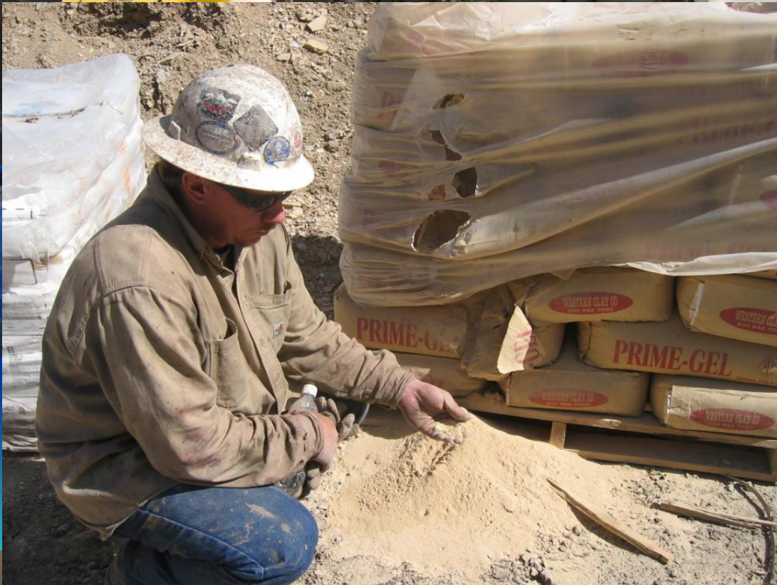
Mud mixing chemicals